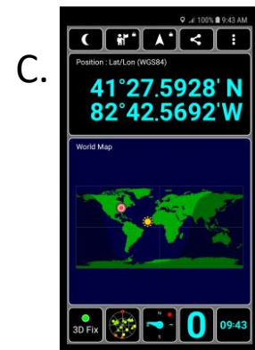
App: GPS Test

Ohio zone boundaries using three common GPS coordinate systems. Boundaries are lines of longitude.