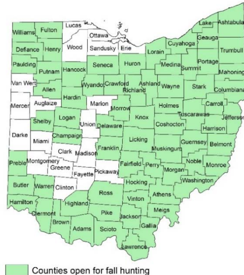
Figure 1. Counties open to wild turkey hunting in fall of 2017.

A total of 11,501 fall wild turkey permits were issued in 2017, a slight decrease from 2016 (11,506). Of the 2017 fall wild turkey permits that were issued, 47 percent were issued to residents, 10.6 percent went to nonresidents, and 7.3 percent were issued to youth hunters. Approximately 35 percent of permits issued were reduced cost or free permits (Table 1).